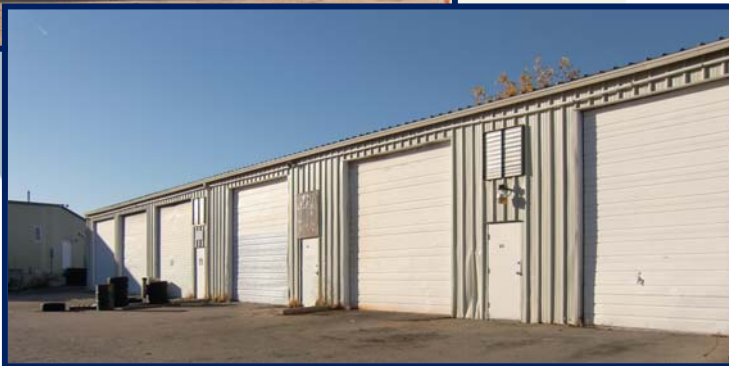
BUILDING A →

The information above has been obtained from sources believed reliable. While we do not doubt its accuracy, we have not verified it and make no guarantee, warranty, or representation about it.