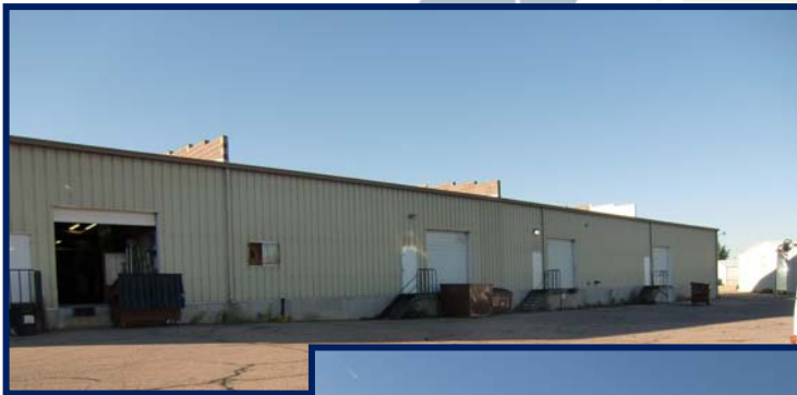
BUILDING B ↑