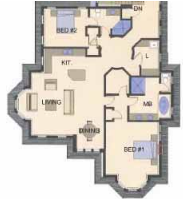
PROPOSED RENOVATION THIRD FLOOR PLAN