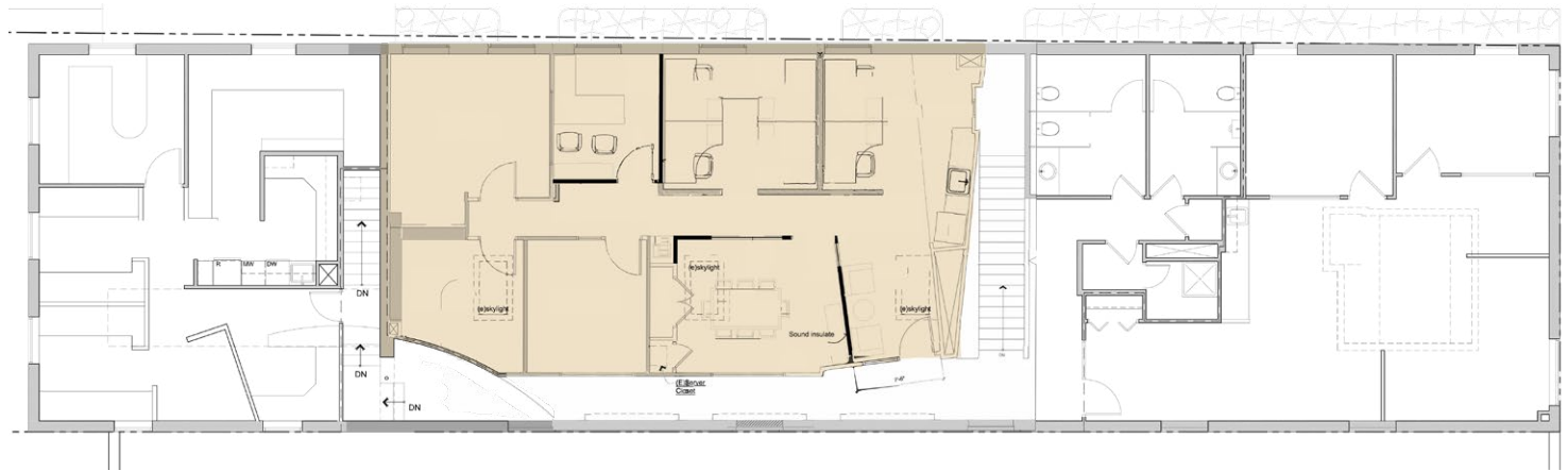
Second Level Floorplan

Suite 103 + Suite 105 + Suite 101 = 4,477 sq. ft.