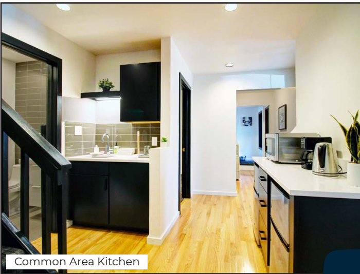
Common Area Kitchen